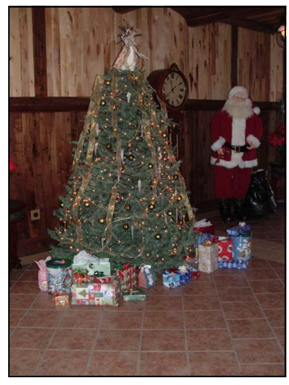
Gifts wait under the tree.