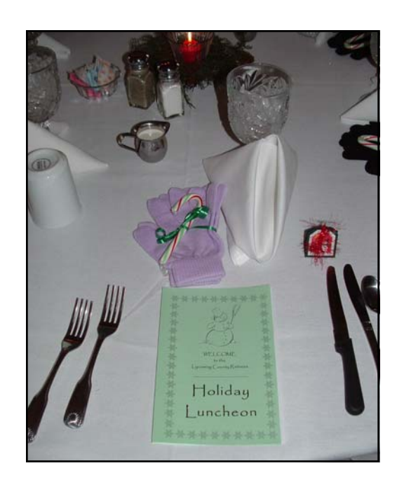
Festive tables set the scene...