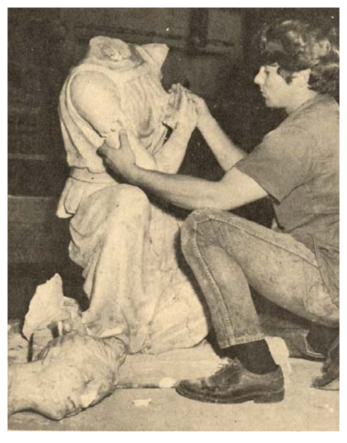
Local teacher attempts repair . . .